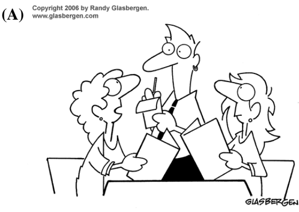
"I'm dieting. I'll have a vanilla ice cream salad with marshmallow croutons and hot fudge dressing."